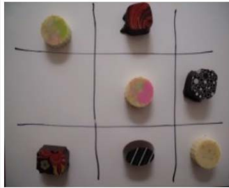
Whether it's hugs or kisses, you win with these Xs and Os in Choco Tac Toe