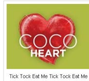
Tick Tock Eat Me Tick Tock Eat Me

Chocolats du Call Bressan: Field Trip. Luckily for me, these crazy French types are near where I live so I was able to drive to their chocolaterie. You, however, can order them online. They will still be delicious and French! The only difference is that I was able to lick their display cases and delicately slurp an espresso. Get over it.