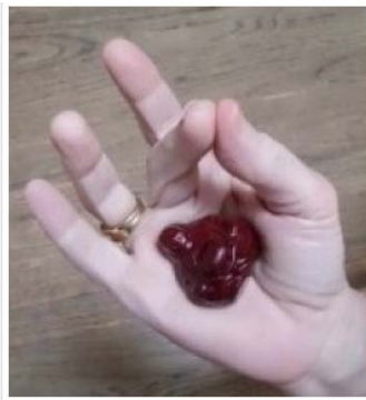
Dear Choco-Caramel Buddha, I shall contemplate your deliciousness. Get in My Belly