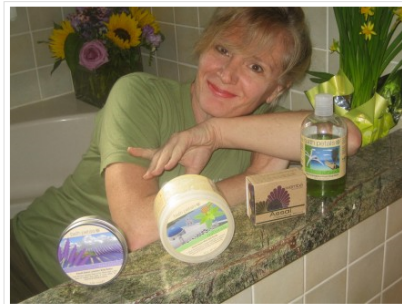
Super Spa Me

Bath Petals: We discovered this family business on the last day of the Natural Products Expo last month and were impressed by the feel, smell and ethics of these bath products. Cruelty free, organic and devoid of nasty stuff that isn't good for your body, we tested the French Alpine Lavender Body Butter, Greek Honey Mint Salt Scrub, and Thai Lemongrass Ginger Body Wash. Maybe I shouldn't have also taste-tested these, but don't the names just sound delicious?