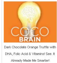
Dark Chocolate Orange Truffle with DHA, Folic Acid & Vitamins! See. It. Already Made Me Smarter!