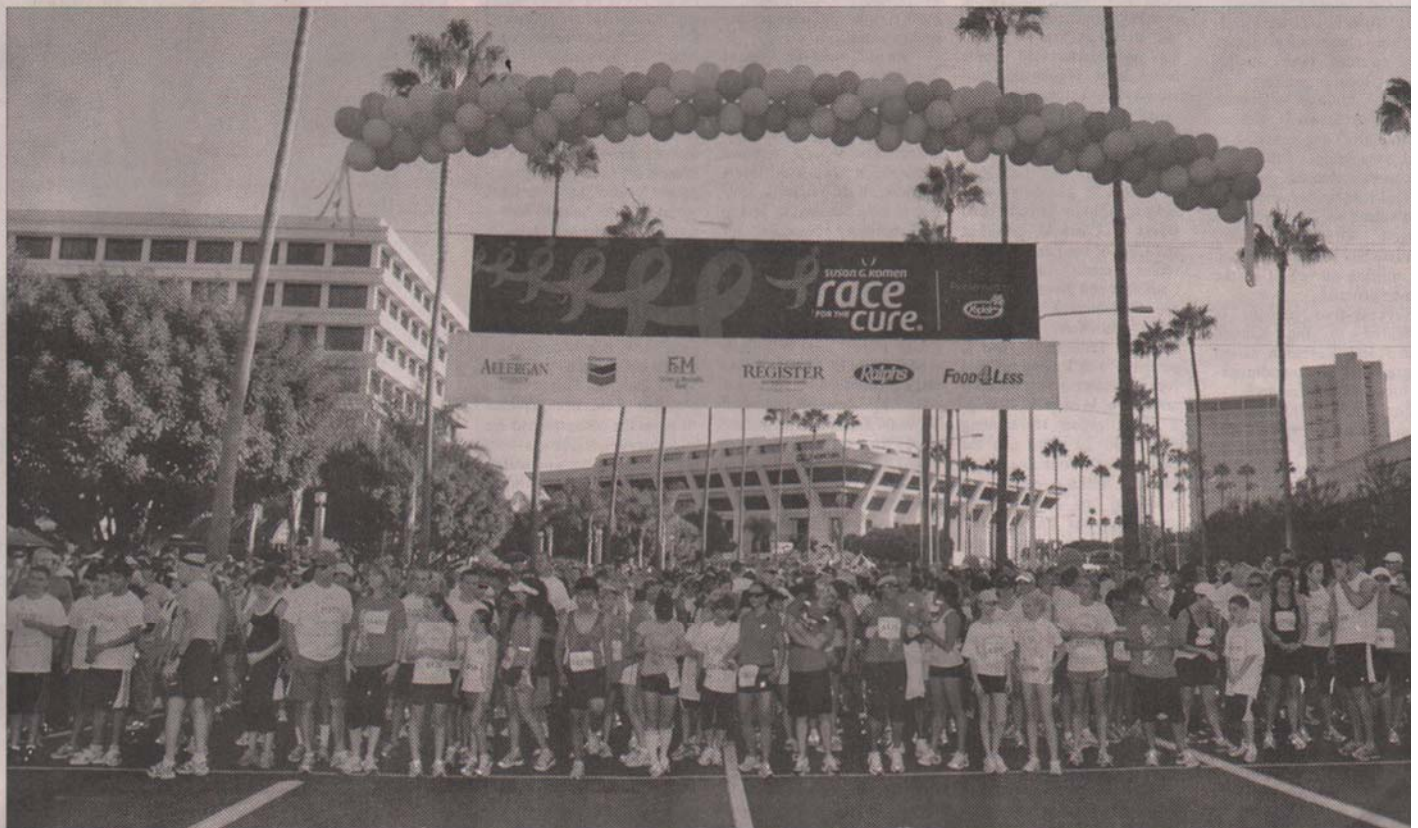
20TH ANNUAL RACE HUGE MILESTONE: Over 30,000 attendees joined forces for the 20th Annual 'Susan G. Komen Orange County Race for the Cure' in Newport Beach, CA., held on Sept. 25, 2011. Event organizers expect to break the $3.1 million goal, topping last year's record at $3 million.