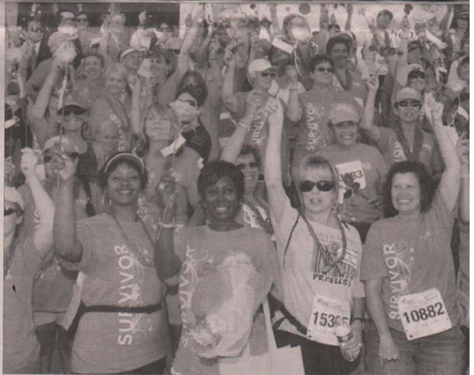
A hallmark of each Race is the Survivor Tribute, where breast cancer survivors are recognized for their fight against and triumph over the disease at a special ceremony in their honor.

More than 1,700 cancer survivors were recognized for their triumph over the disease with a special tribute in their