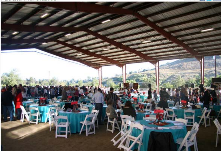
Nearly 300 people attended Working Wardrobe's fundraiser Sunday evening at the J.F. Shea Therapeutic Center in San Juan Capistrano.