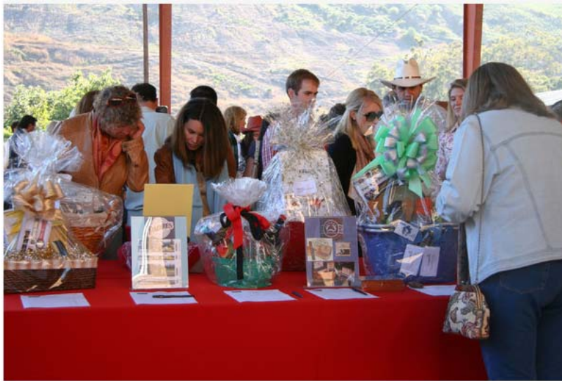
A silent auction at the 3rd Annual Blue Jeans, Boots and Swing fundraiser included gift certificates for music lessons, tickets to Sea World and a 'yoga bliss' package.