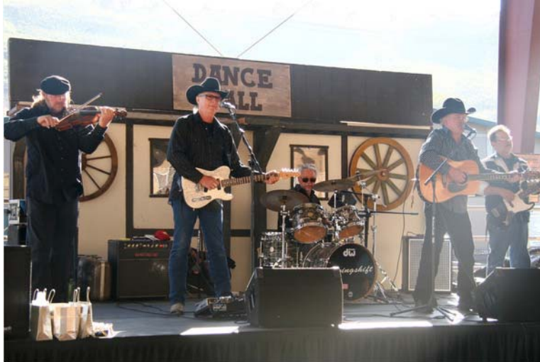
The band Swing Swift plays live music for a crowd of nearly 300 Sunday.